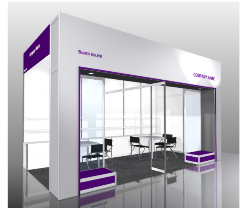
COLOUR PERSPECTIVE N.T.S

System side panel w/. grey sticker (OR 072) fin.